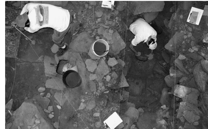
Excavation of 18th century domestic site, North Stonington, Connecticut.