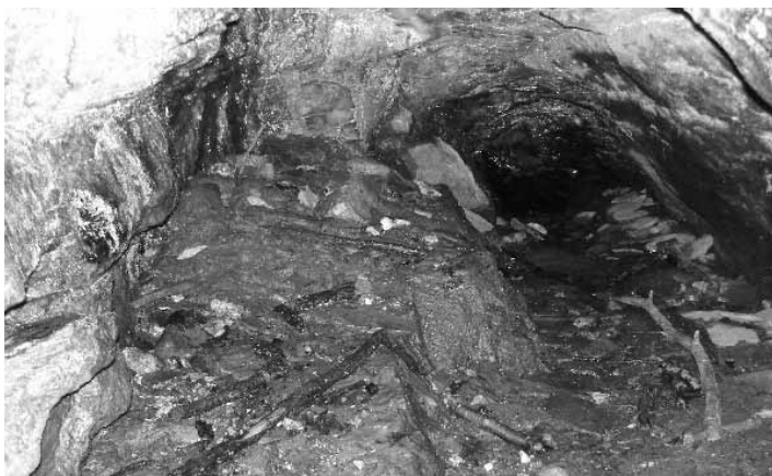
Looking down into the depths of Moodus Cave.

By the 19 th century, a scientific point of view was taken as to the cause of these noises. It was thought that maybe these noises were seismic disturbances. Finally in 1981, scientists studied the area. They “used a series of special underground sensors to monitor for seismic conditions; otherwise, the earthquakes are too small to detect” (Hartford Courant 15 Aug 2007: B.2.). They detected over 500 micro-earthquakes over a 3-month period (Hartford Courant 15 Aug 2007: B.2.). These small quakes produce audible sounds, and hence the strange Moodus noises that have been reported near the confluence of the Moodus and Salmon Rivers in the Cave Hill and Mt. Tom area.