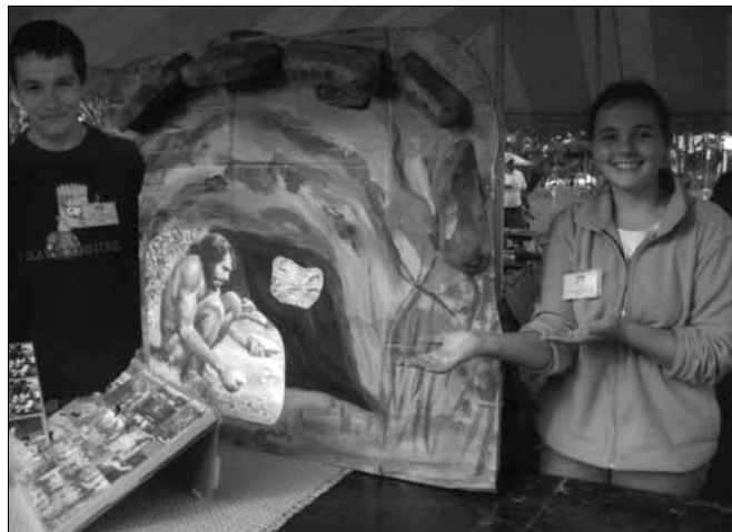
Native American Festival.