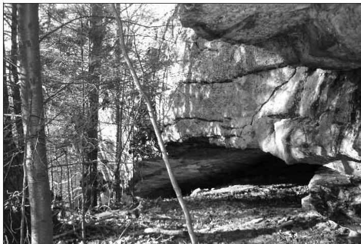
Rock shelter at Cave Hill.