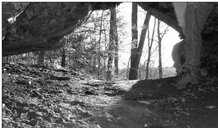
Looking out of Moodus Cave.

A day trip to both Machimoodus State Park and Cave Hill is a day well spent. This State Park offers hiking, horse-