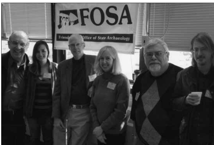
FOSA volunteers at CGN Symposium.