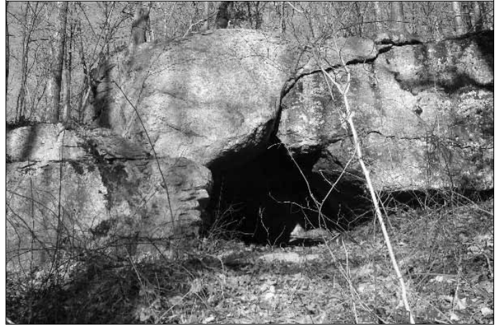
Entrance to Moodus Cave.