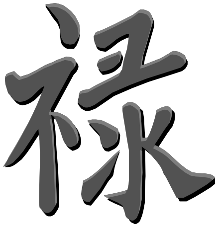
Chinese Characters for “prosperity.”

“It’s a neat thing to get the public involved and show them that in their backyard, they have 100 years of history,” he said. “It will be nice to give back to the community, not necessarily a lost history, but a better view of the past.”