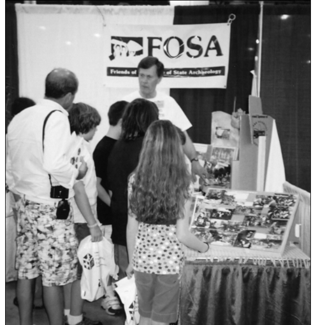
Outreach programs ~ Enhancing public awareness of the importance of archaeology in Connecticut.