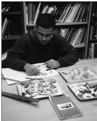
In the office ~ Student volunteer cataloging artifacts.