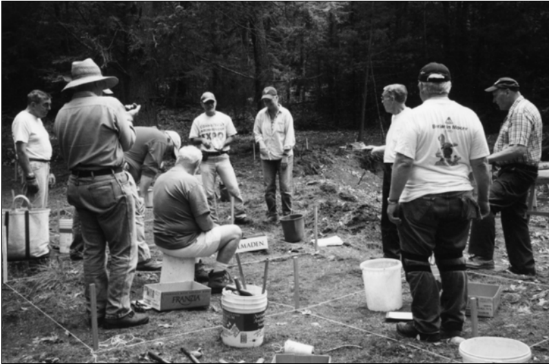
In the field ~ Helping to uncover Connecticut's past.

This month the spotlight is on all FOSA members in appreciation of their— of your —volunteer time, financial support and dedication.